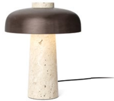
Reverse Table Lamp, Bronzed Brass