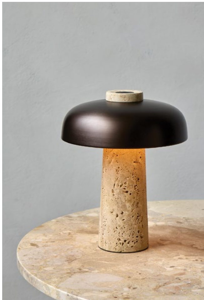
Reverse Table Lamp, by Aleksandar Lazic