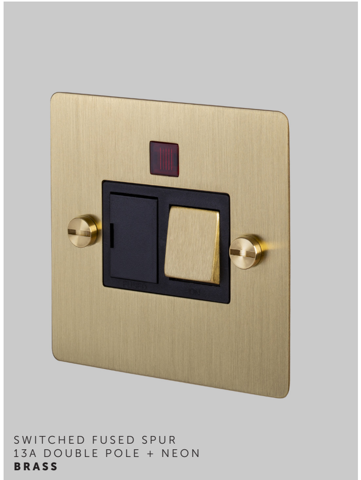
SWITCHED FUSED SPUR 13A DOUBLE POLE + NEON BRASS