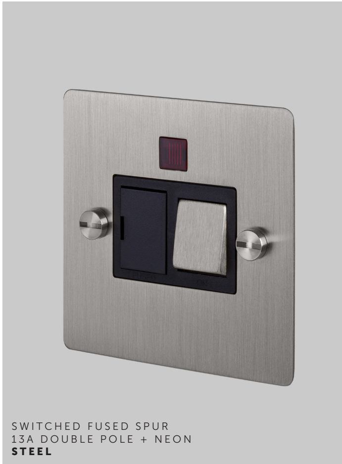
SWITCHED FUSED SPUR 13A DOUBLE POLE + NEON STEEL